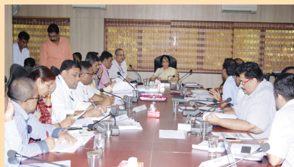
10 th CSMC meeting held at New Delhi on 22 July 2016

A total Central Share of Rs 4057.8 Cr is involved for 2.71 Lakh houses accepted as above.