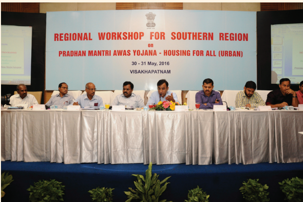
Dignitaries on the dias during Southern Region Workshop held at Visakhapatnam on May 30-31, 2016