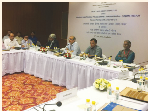
CLSS Review Meeting held on June 17, 2016 at New Delhi

Further, it was concluded that more emphasis to be given to awareness generation amongst stakeholders and beneficiaries including govern-