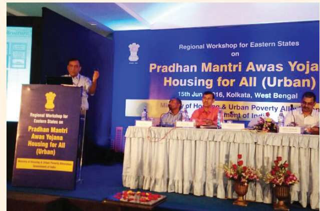
Dignitaries on the dias during Eastern Region Workshop held at Kolkatta on June 15, 2016

The workshop saw participation from senior officials from West Bengal, Odisha, Bihar and