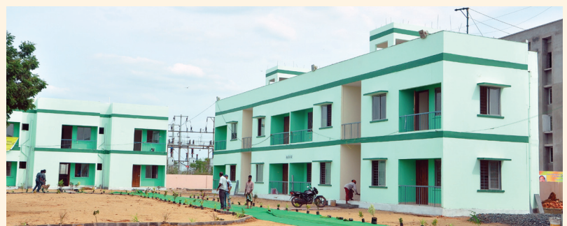
Demonstration Housing Project at SPSR Nellore, AP

The Demonstration Housing Project comprises of 36 G+1 houses along with Community Centre at Nellore. This is first of its kind project where Glass Fibre Reinforced Gypsum (GFRG) panels which are made from a waste material called phospho-gypsum, a byproduct of fertilizer plants. The project has evinced interests amongst construction fraternity and the project has already been visited by professionals, entrepreneurs and developers.