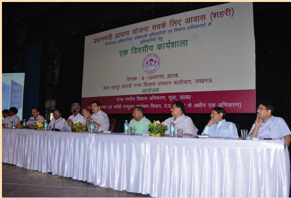
Workshop was organized by SUDA, Lucknow for capacity building of officials on Pradhan Mantri Awas Yojana (Urban) on 10 th August 2016