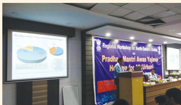
Regional Workshop on Pradhan Mantri Awas Yojana (Urban) held on July 15-16, 2016 at Guwahati, Assam