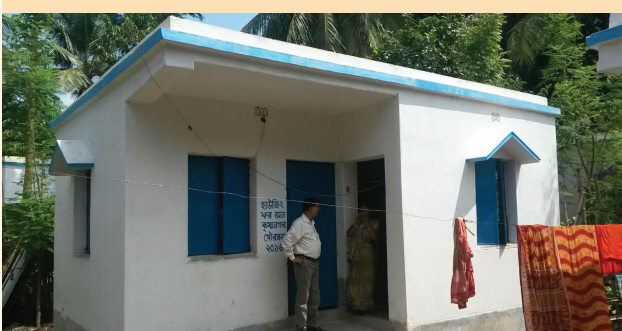
Completed and Geo Tagged individual house, constructed under BLC at Krishnanager, West Bengal