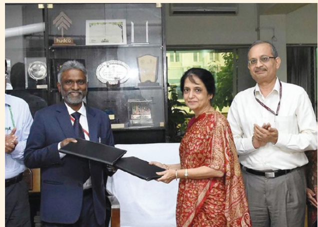
Signing of MoU between HUDCO & MoHUPA