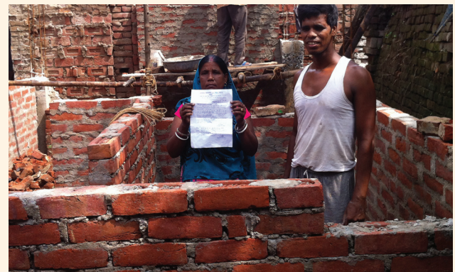
Beneficiary Family in Bihar Sharif getting second installment for construction of their house under BLC of PMAY(U)